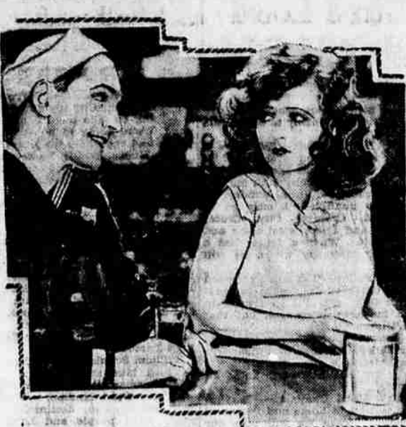
Clara Bow and Frederic March in a scene from 'True to the Navy,' her latest talker which opens at the Fox Craterian theater tomorrow for two days only.