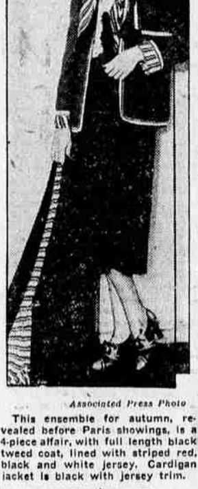
This ensemble for autumn, revealed before Paris showings, is a 4-piece affair, with full length black tweed coat, lined with striped red, black and white jersey, Cardigan jacket is black with jersey trim.

NEW YORK (AP)—The return of long skirts is altering the summer girl's opportunities for getting her health tan.