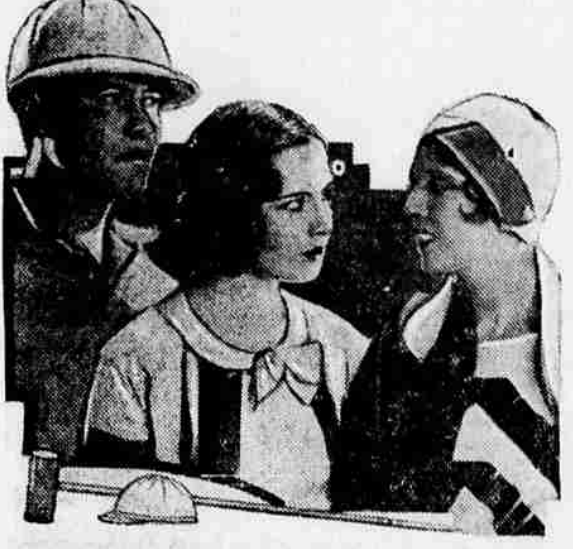
Jack Oakie, Mary Brian and Olive Borden in a scene from the all-talking comedy, "The Social Lion."

Jack Oakie, that irrepressible wizard of the art of wise-cracking, comes to the Fox Craterian theater today in "The Social Lion," a comedy drama based on the story, "Marco Himself" by Octavus Roy Cohen.