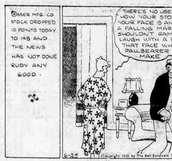
THE NEBBS—An Honest Face