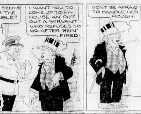
By SOL HESS