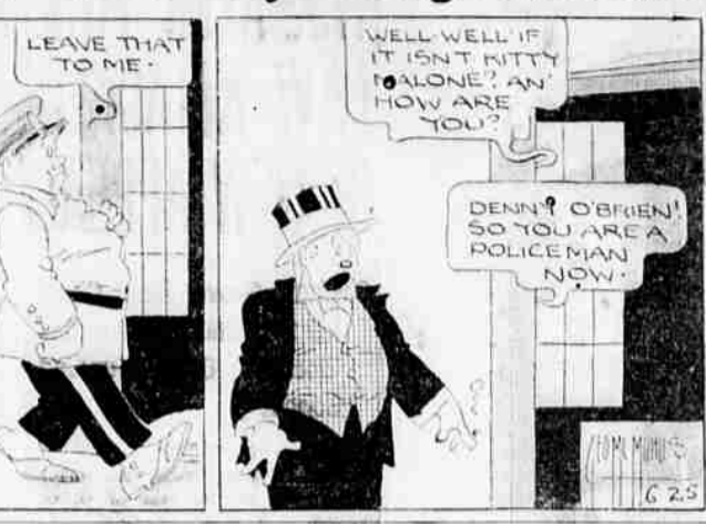
By SOL HESS