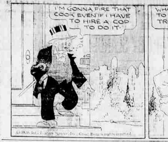
THE NEBBS—An Honest Face