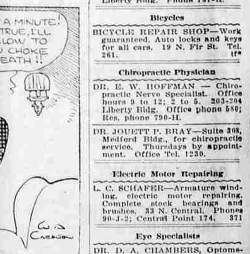
THE NEBBS—The Naked Truth