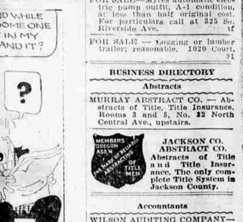
THE NEBBS—The Naked Truth