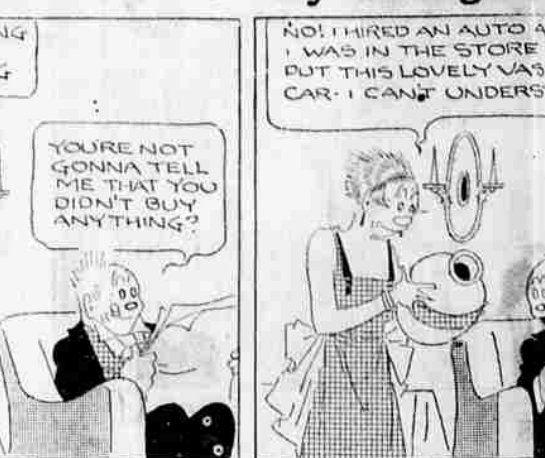
THE NEBBS—The Naked Truth