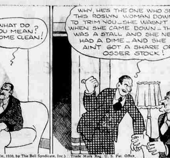
THE NEBBS—The Naked Truth