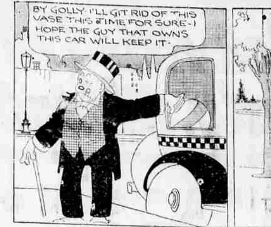
THE NEBBS—The Naked Truth