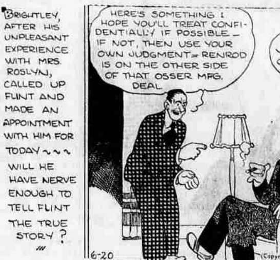
THE NEBBS—The Naked Truth