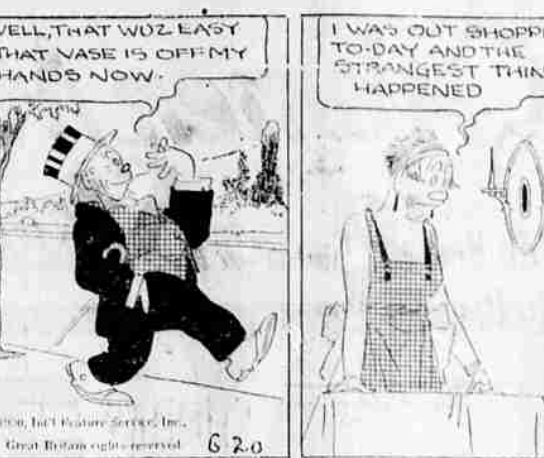
THE NEBBS—The Naked Truth