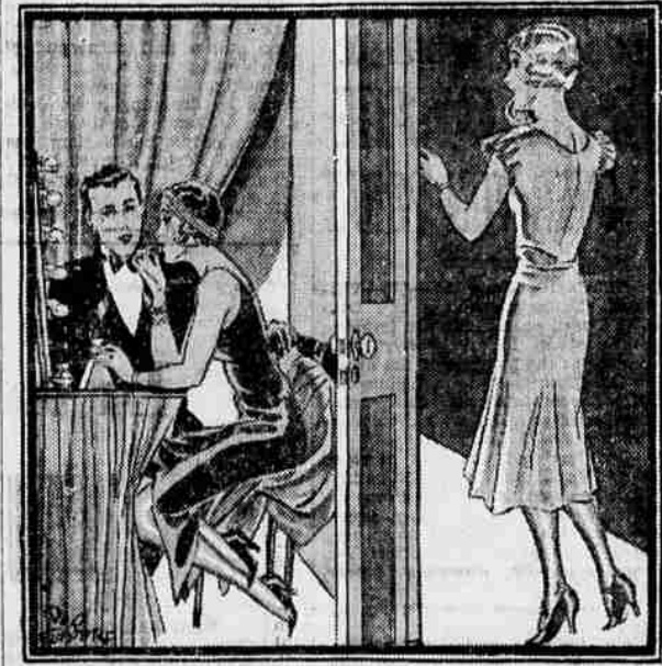
Mary Lou overheard Brynmor's voice in Clarice's dressing room.

TONY danced away with Mary Lou at double pace. The faster he danced, the steadier he felt on his legs.