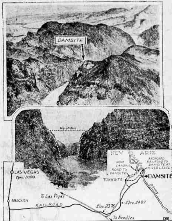
These precipitous grades at Boulder dam site must be conquered by engineers establishing railroads, highway and workmen's town show in map.