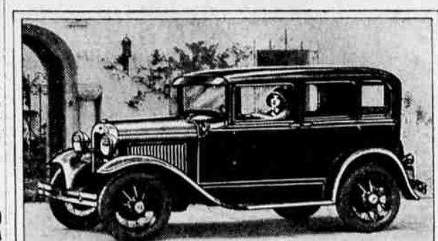
Ford Town Sedan

TRIMMING and interior appointments are among the outstanding features of the new Ford Town Sedan. Seats are upholstered in either brown mohair or deep tan Bedford cord with luxurious wall and ceiling trimming to harmonize. The front seat, wide and deep, is easily adjusted to suit the convenience and comfort of the driver. The rear seat, which accommodates three persons, has an arm rest at either side and a folding arm rest in the center. Interior hardware is of scroll design. Curtains are provided for the rear and rear quarter windows, and there is a flexible robe rail on the back of the front seat.