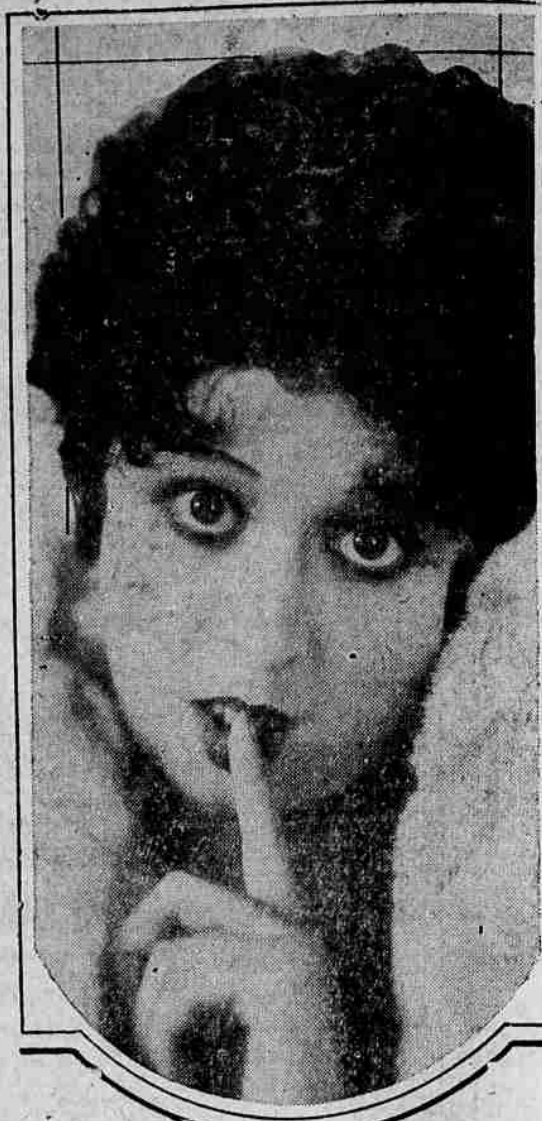
EVEN THOUGH HELEN KANE , above, did start the vogue for boop-boop-a-doop singing, you can't be angry with her so long as she looks as wistful as this. You have probably heard baby-voiced Helen on the stage, or in the talkies, or over the radio.