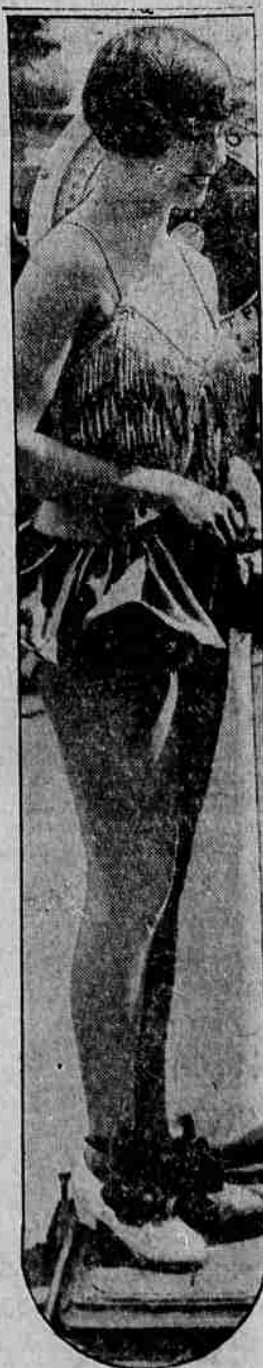
LOOK A-WEIGH! —Just to be sure that she keeps in trim, this shapely chorus girl, like 2000 other Fanchon and Marco dancers, must follow a prescribed diet and then see what the scales say each week.