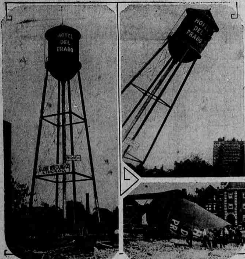
A TOWER BITES THE DUST —The three stages in the demolition of the water tower of the old Del Prado hotel in Chicago are graphically shown above. The tower was demolished to make room for the new $1,000,000 International House to be built on the campus of the University of Chicago for its foreign students.