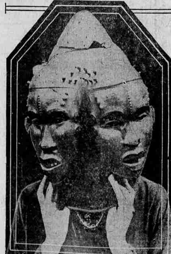
ON THE FACE OF THINGS you'd think that this hand-carved "devil mask" would be just the thing to wear at a masquerade. But—and here's the rub—it is covered with lacquered human skin. Anyway, this African relic was eagerly sought by collectors from all over Europe when it was offered for sale recently in London.