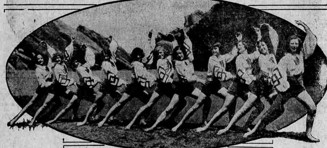
NOT IN THE TALKIES, BUT IN THE ROCKIES are these charming mountain nymphs who thought they'd take a peak at the Park of the Red Rocks at Denver before it was officially opened for the summer. They are shown here among the rocks and rills, executing a graceful turn which it would be worth climbing the highest mountain to see.