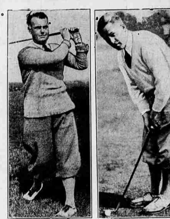
Cyril Tolley (left), defending British champion, and Bobby Jones of America, furnished one of the most exciting matches ever played on the historic St. Andrews course when Jones eliminated the Britisher on the 18th hole.