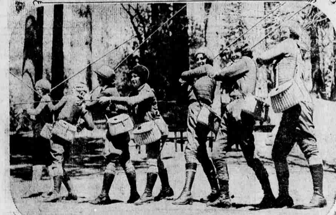
IT LOOKS FISHY TO US because there isn't any water around, but really, these pretty minnows are doing their damndest to catch a trout or two. In fact, the girls are pictured here competing for trophies in the feminine fly-casting championships held recently at Los Angeles.