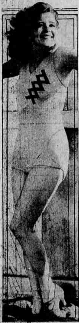
KING CANUTE once tried to stop the tide, but he never knew that Clara Bow, above, would one day appear in this arresting one-piece bathing suit. Clara, who does her stuff in the movies, seems to be in ship-shape condition.