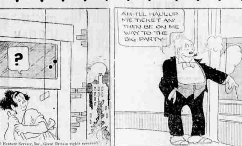
By SOL HESS