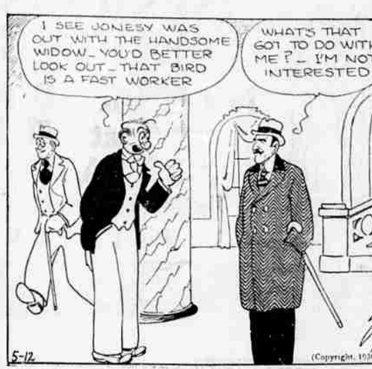
Copyright, 1930, by The Holt Syndicate, Inc. Trade Mark Reg. U. S. Pat. Office