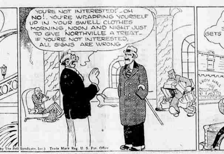
Copyright, 1930, by The Holt Syndicate, Inc. Trade Mark Reg. U. S. Pat. Office