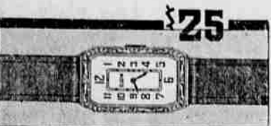
The girl graduate will appreciate this exquisite engraved Lady Elgin. An accurate dependable timepiece that will be a lasting reminder of the giver's good judgment.

An Elgin Watch is always a most fitting remembrance for the graduate. It commemorates commencement day in a most lasting way. It is received with enthusiasm... it is treasured as something precious... it always brings grateful thoughts of the donor.