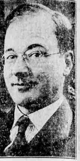
Avery Brundage of Chicago was elected president of the Amateur Athletic union at the convention in St. Louis.