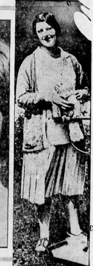
Dashing Prince Carol of Rumania, who gave up the throne for life with titan haired Mme. Lupescu (right), is reported seeking forgiveness of his wife, Princess Helen (center), who is mother of his son, King Michael.