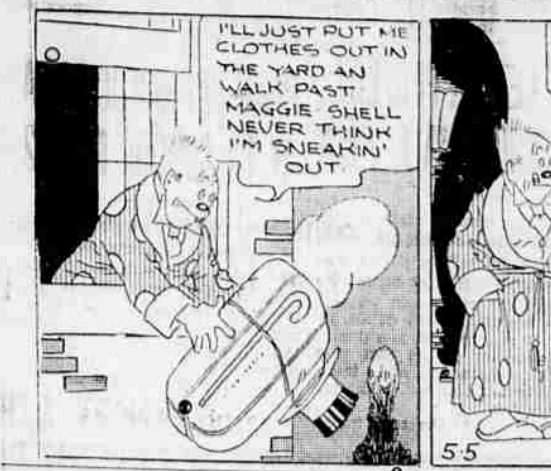
THE NEBBS—Sorry I Mentioned It