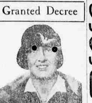
RENO, Nev., May 3.—(AP)—Lady Mary Heath, famous British aviatrix, was granted a divorce here today from Sir James Heath, wealthy British iron master, on grounds of extreme cruelty.

BEVERLY HILLS, May 3.—That Chamber of Commerce of the United States that is in session in Washington now is running true to chamber of commerce form. They have the maximum of objections with all the minimum of remedies for all our national ills. Of all the things that this country is suffering from is overproduction of organizations to help somebody that don't need the help as bad as the organization itself. It's not taxes that keeps us fat; it's dues. When the Judgment Day comes, half of America will be on their way to some convocation and the other half will be signing application blanks. Yours, WILL ROGERS.