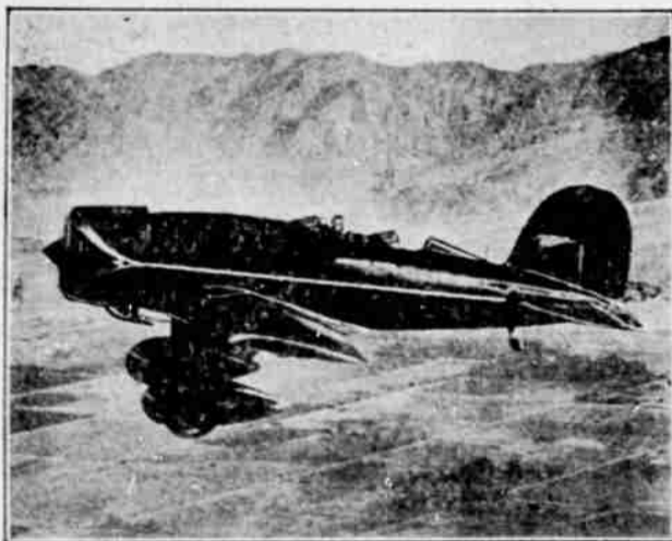
Colonel Lindbergh's new "mystery ship" which has a speed of 200 miles an hour and cruising radius of 2,300 miles. Where is the Lone Eagle going next?

BURBANK, Calif.—A new plane for Lindbergh, fast and powerful, has just received its first test flight here and set the aviation world agog as to what the Lone Eagle is planning. A lucky photographer managed to get an excellent picture of it during the test flight.