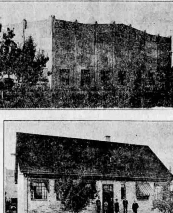
Medford's Central Fire Station, constructed during 1929 at the corner of Front and Third streets. The Medford Fire Department's fire fighting equipment is also shown.