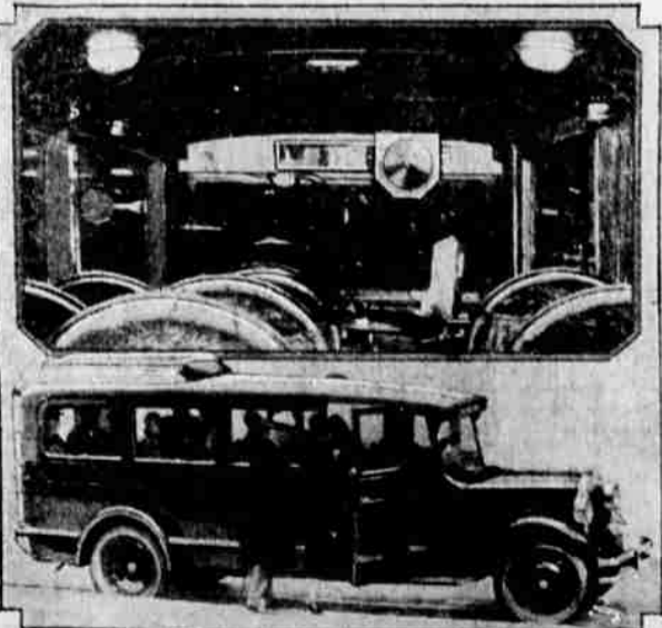
Above—One of the two magnetic speakers used in the specially designed Transitone bus-type receiving set for Dodge Brothers parlor coaches. The other speaker is located in the rear of the coach. This double speaker system produces volume sufficient for programs to be clearly and pleasantly audible in all parts of the coach, and at the same time so modulated as not to interfere with passengers conversing in an ordinary tone of voice. Below—Dodge Brothers parlor coach used in deluxe service in many cities, and in which radio equipment was first used.