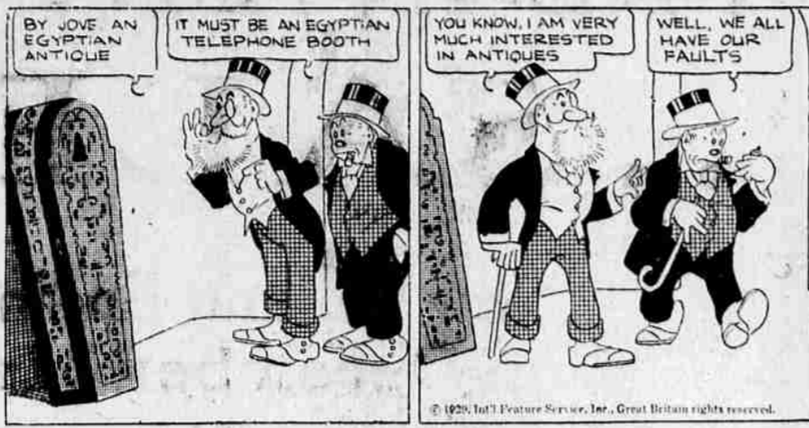
THE NEBBS—Laugh, Clown, Laugh