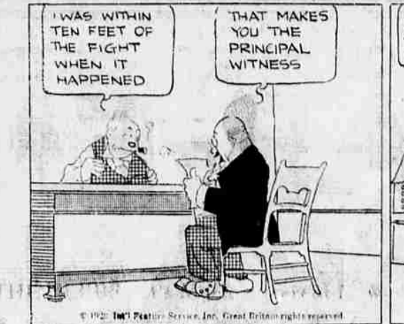
THE NEBBS—It's Much Different Now