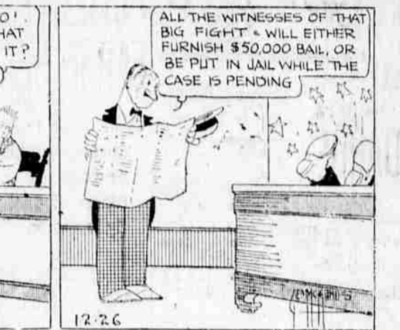
THE NEBBS—It's Much Different Now