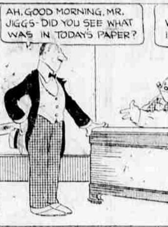
THE NEBBS—It's Much Different Now