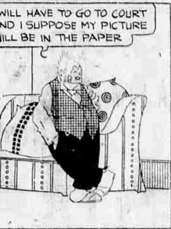
THE NEBBS—It's Much Different Now