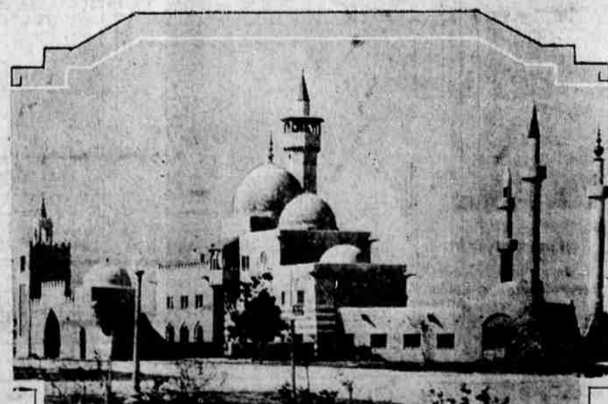
TRUE ARABIC STYLE OF ARCHITECTURE was followed in constructing the administration building, shown above, which Glenn H. Curtis, pioneer airplane manufacturer, presented to the city of Opa Locka, a suburb of Miami, Fla. Residences, stores, garages and even names of the streets in Opa Locka are in Arabic style.