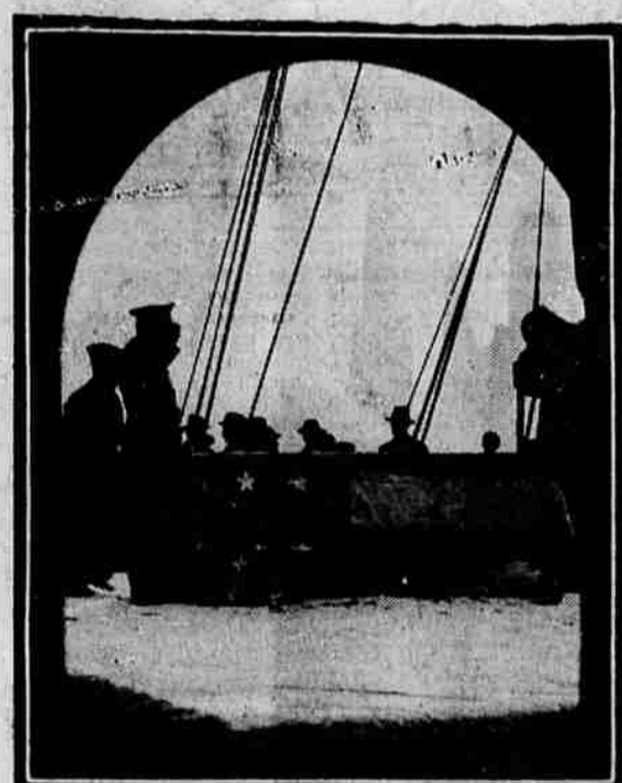
LAST OF THE "POLAR BEARS" of the A. E. F.—75 soldiers who died in North Russia—were brought home recently aboard the S. S. President Roosevelt. This unusual picture shows the escort of honor standing at salute over the caskets as the ship paused by New York City's skyline.