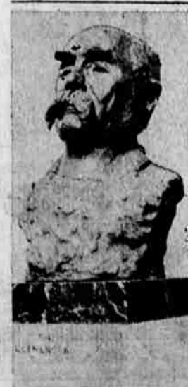
THIS BUST of the late Georges Clemenceau is one of the many works of art in the new Rodin Museum in Philadelphia.