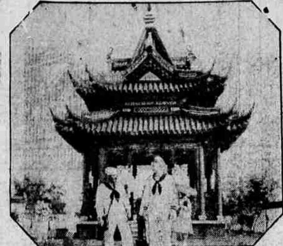
AMERICAN BLUEJACKETS serving on board the U. S. S. Pittsburgh, flagship of the Asiatic fleet, are shown above visiting the odd-shaped Longhwa Pagoda, while ashore at Shanghai, China.