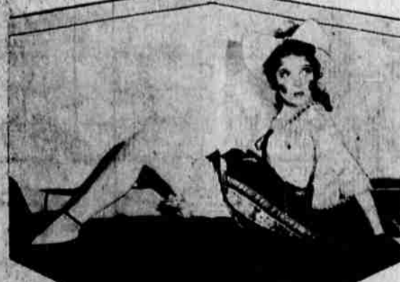
SHE FAW DOWN AND GO PLOP! Loretta Young, cinema favorite, gives her interpretation of a mechanical doll with due results.