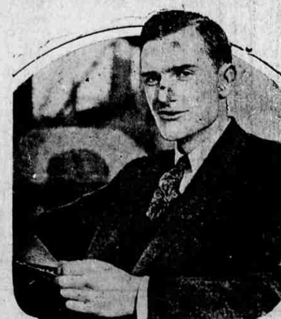
JOHN D. ROCKEFELLER III—23 years old and just out of Princeton—went to work recently at 26 Broadway, headquarters of the far-flung Rockefeller interests. He is pictured above at his desk as he began "helping father."