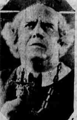
CHARACTER studies of Edith Mason as Marguerite in "Faust," and Alexander Kipnis as the Cardinal in "The Jewess" presented by the Chicago Civic Opera Company, are shown above.