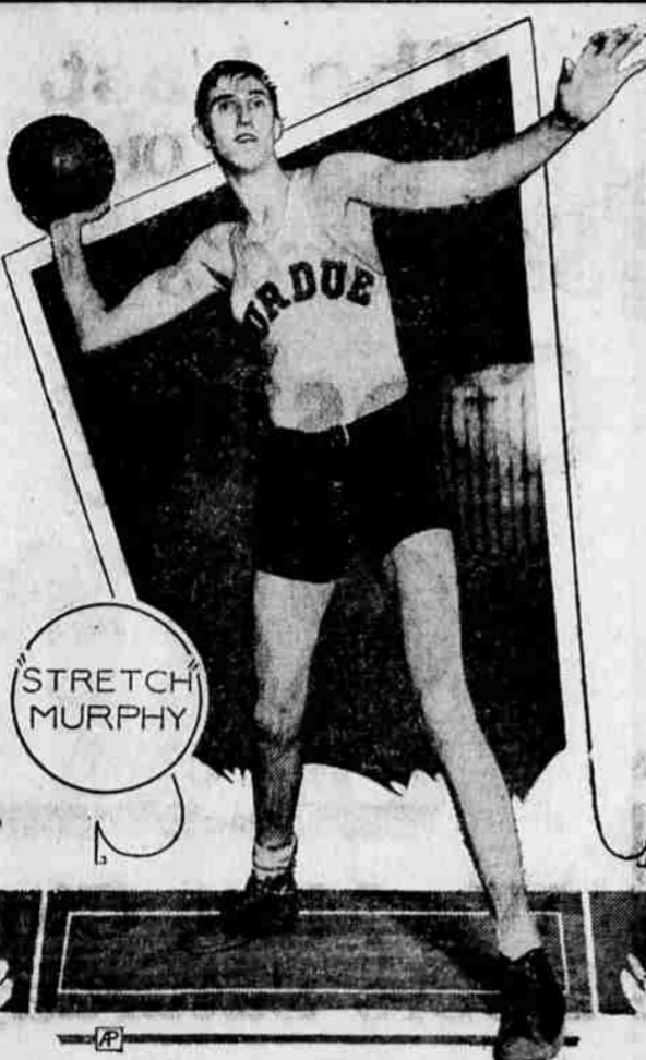
This six-foot, six-inch center, who was the Big Ten's high scorer last year, is the main reason Purdue is favored in the coming western conference campaign.