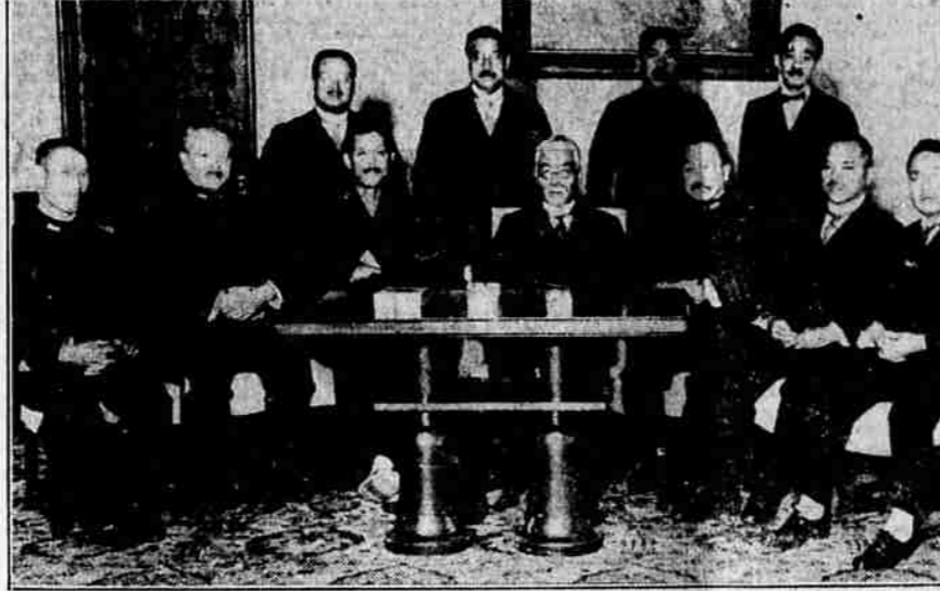
Members of the Japanese delegation to the naval disarmament conference will confer with President Hoover in Washington before proceeding to London for the opening of the conference in January.