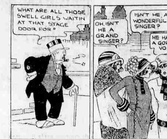
THE NEBBS—The Awakening