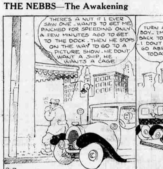
Trade Mark Reg. U. S. Pat. Office