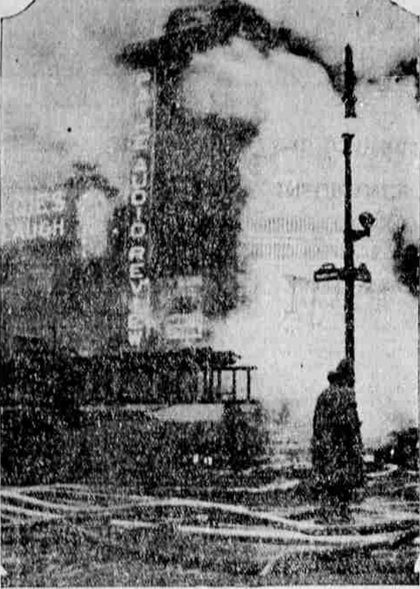
This Associated Press telephoto was taken during a fire at the Manhattan studios and Pathe film exchange in New York in which ten lives were lost. Seventy-five persons were trapped in the building.