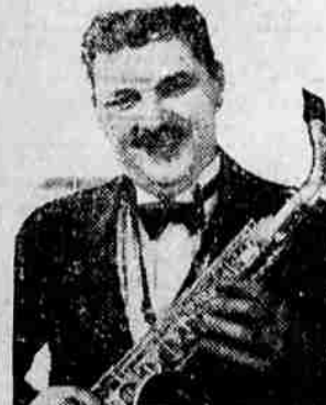
"Sax" Drives Away Thoughts of Cold!

He thought he couldn't play that night, but the cold he'd caught that morning had departed. Most professional people know what really knocks a cold in a few hours; many