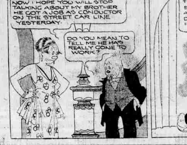
THE NEBBS—Know Thyself