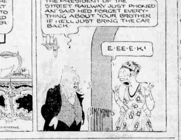
THE NEBBS—Know Thyself