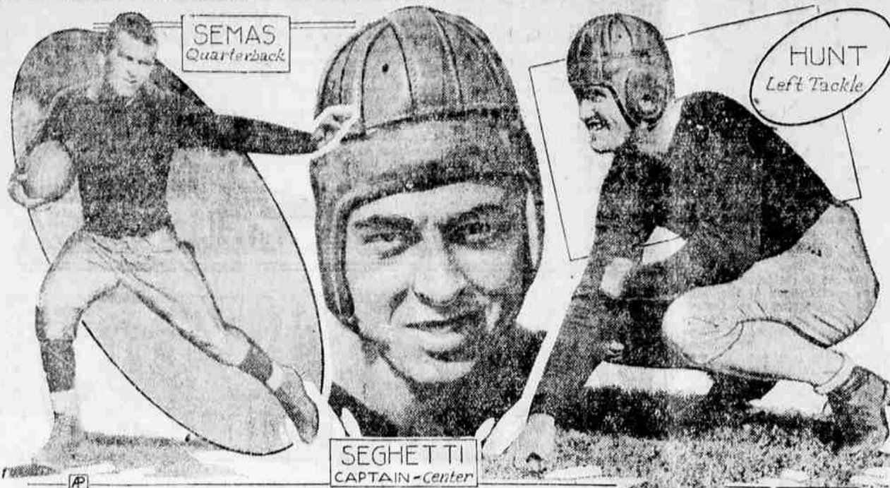
These three stalwarts have helped make St. Mary's of Oakland, Cal., a strong candidate for the honor of representing the Pacific coast in the annual Tournament of Roses game at Pasadena, New Year's Day.