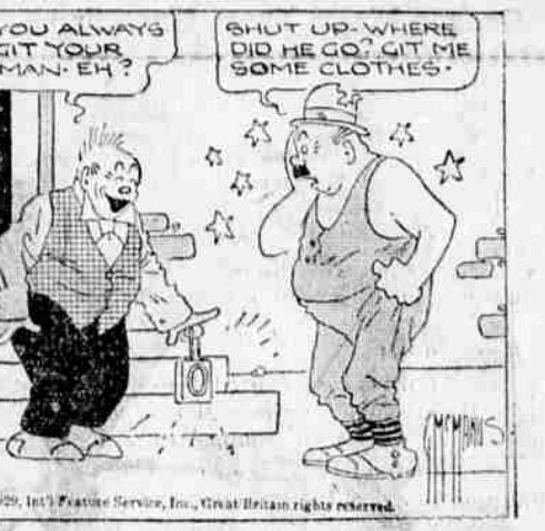
THE NEBBS—The Confession