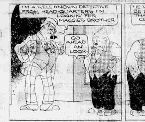
THE NEBBS—The Confession