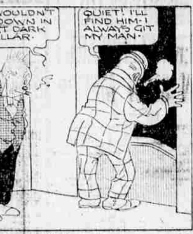
THE NEBBS—The Confession