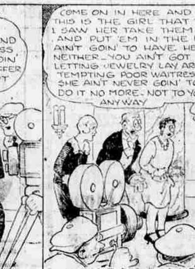
Copyright, 1929, by the Hall Syndicate, Inc. Trade Mark Reg. U. S. Pat. Office