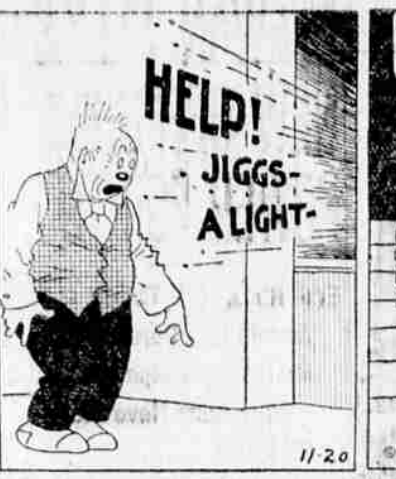
THE NEBBS—The Confession