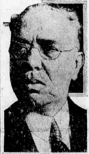
Pascual Rubio.

MEXICO CITY, Nov. 18.—(AP)—Nineteen were killed and more than 50 wounded in nation-wide rioting Sunday which accompanied overwhelming election of Pascual Ortiz Rubio to the Mexican presidency. Headquarters for Jose Vasconcelos, candidate of the anti-revolutionist party charged that supporters of Ortiz Rubio had taken charge of voting booths and through force and intimidation prevented tens of thousands from voting.