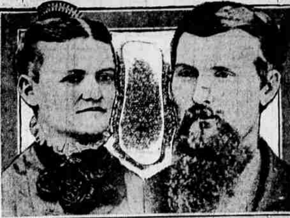
Hilda Minthorne Hoover and Jesse Clark Hoover, mother and father of Herbert Hoover, from an old tin type. Jesse Hoover died when Herbert was six and his wife four years later.