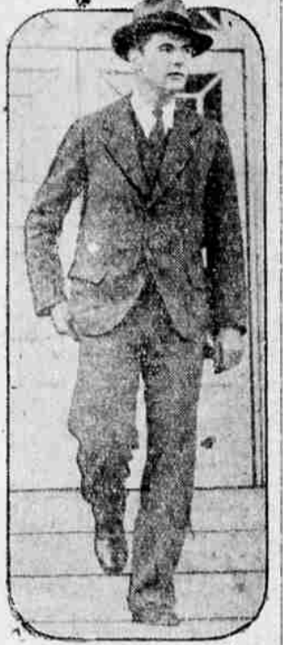
Allan Hoover, son of the President, leaving the administration building after registering as a student at the Harvard university school of business administration.