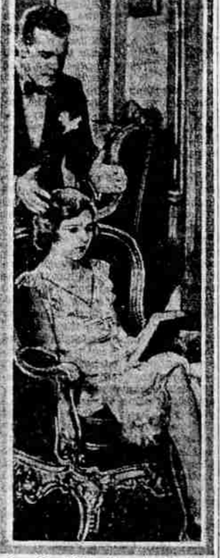
Scene from "Stolen Kisses" starring May McAvoy and Walter Connolly.

Paris offers more than anyone expects, for such a wild pandemonium of frolics, turfdelows, fair