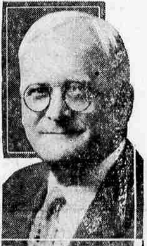
John Garland Pollard

Pollard, until the opening of the campaign, dean of the Marshall-Wythe school of government and citizenship at the College of William and Mary, led the vigorous Democratic party to triumph over the coalition of Anti-Smith Democrats and Republicans in yesterday's election. The Democratic