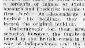
© 1929 King Features Syndicate, Inc. All rights reserved.