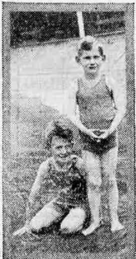
It's easy to see from their wonderful condition that the mother of these youngsters knows what to do when their stomachs or bowels go wrong. No drugs for her! Nothing but pure vegetable California Fig Syrup. At least a million families are never without a bottle of it in their homes!