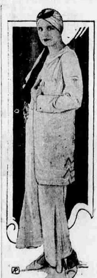
This three-piece ensemble is designed as a "dress pajama" outfit, and is suggested as appropriate for the afternoon tea. The dancing sandal is moir and silver.