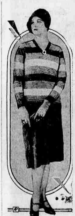
Blue, striped with white, is this combination for general wear. The stitched felt cloche is accented with a blue and white feather. Shoes are calf and suede.