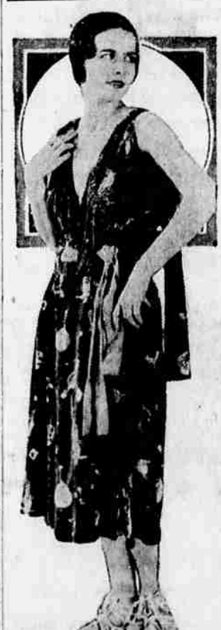
The pleated trousers here might well pass as a skirt. They are of a scarlet print. This pajama ensemble can be worn any time of day, in lieu of a frock.