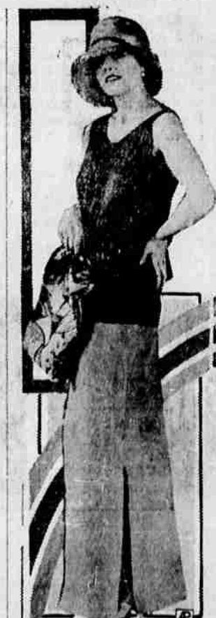
A modified Chinese note occurs in this pajama ensemble of sun-bank pullover and wide trousers. The novelty hat promises to create a wide vogue.