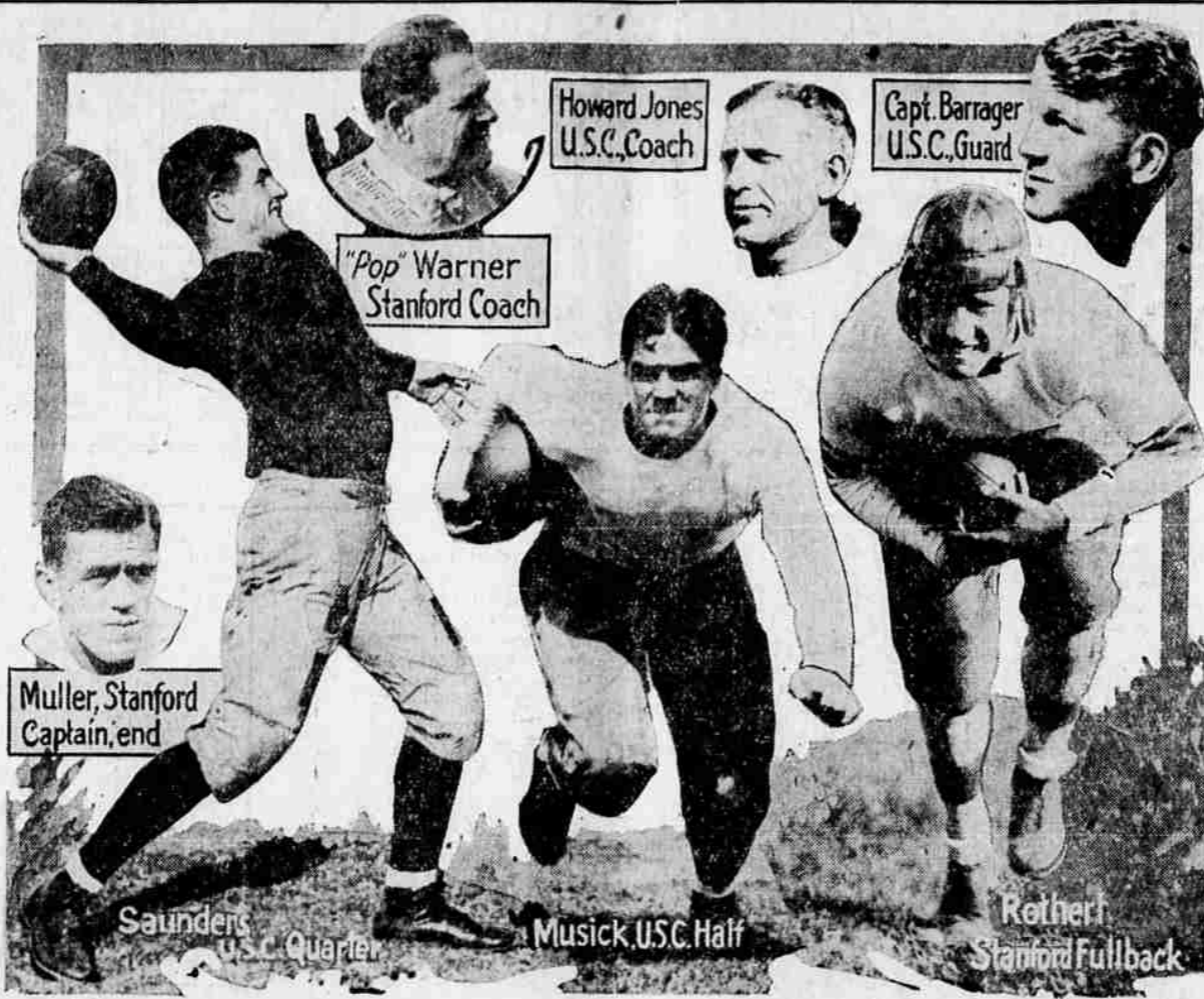
Disciples of the Pop Warner and Howard Jones brands of football are modestly admitting that the greatest game of the 1929 season in the west will be played between Stanford and Southern California at Palo Alto, Oct. 26. Thereby California's claims are waved aside with an airy gesture but the winner of this skirmish must beat the Golden Bear to obtain a clear title to the conference crown.