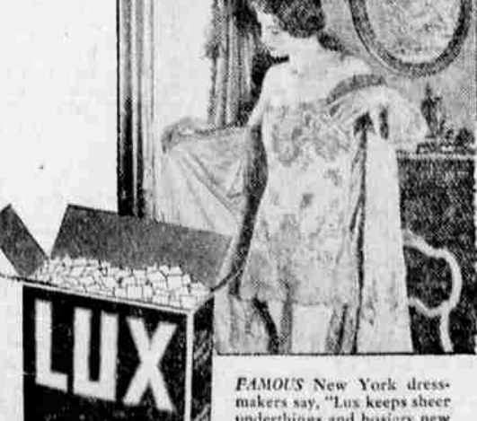
makers say, "Lus keeps sheer underthings and hosiery new looking twice as long. (Above) pretty model for exclusive Fifth Avenue establishment, in lovely lingerie and negligee.