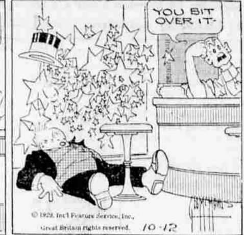
© 1929, Inc'l Features Service, Inc. Great Britain rights reserved. 10-12