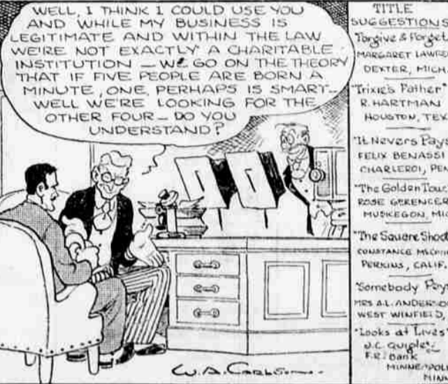
Trade Mark Reg. U. S. Pat. Office