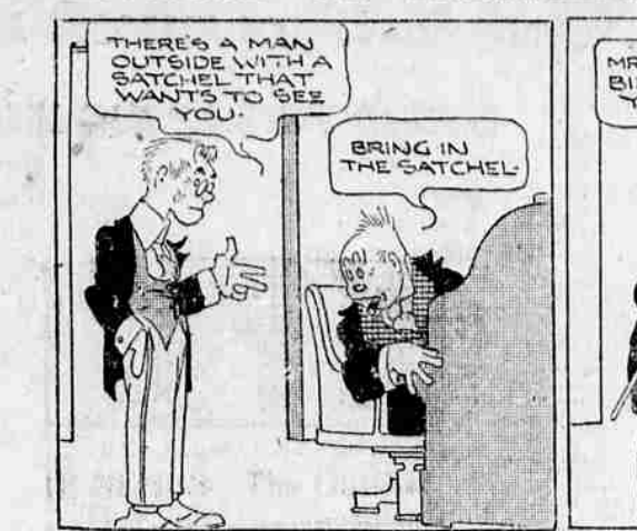
THE NEBBS—The Outcast