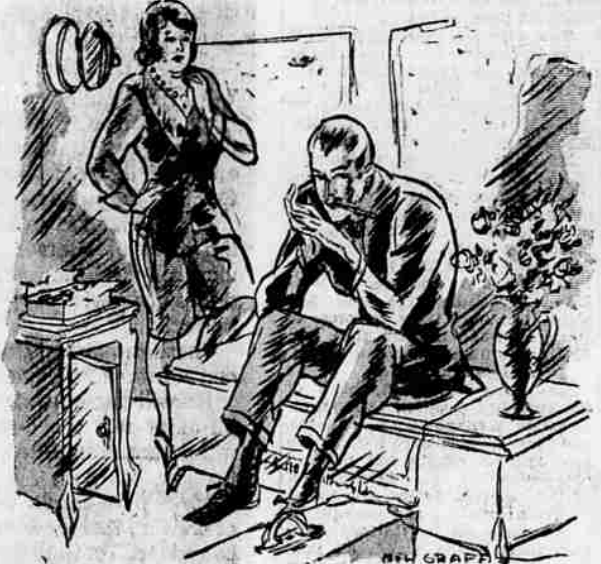
Henderson plans—a crafty scheme to separate Barbara from Ray.

IT was all over the ship the next morning that Barbara Landon had married the saxophonist in the orchestra. It began as a whispered rumor which grew in force, as the facts became known, until it dominated the conversation everywhere; on the decks, in the lounges; it even penetrated to the kitchens. Cora Trenton-Jones found herself the center of an eager, questioning mob who invaded her state-