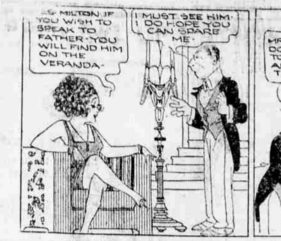
THE NEBBS—The Sage