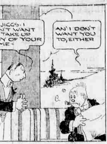
By SOL HESS