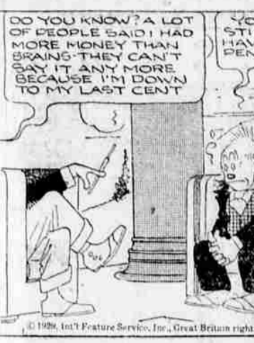
By SOL HESS