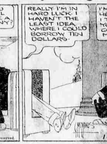
By SOL HESS