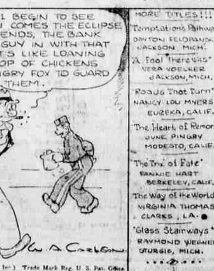
EVERY TIME I BEGIN TO SEE THE LIGHT, ON COMES THE ECLIPSE. MY GOOD FRIENDS, THE BANK THREW THAT GUY IN WITH THAT LOAN AND IT'S LIKE LOANING A GUY A COOP OF CHICKENS AND A HUNGRY FOX TO GUARD THEM.