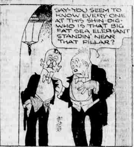
SAY YOU SEEM TO KNOW EVERY ONE AT THIS SHIN DIG. WHO IS THAT BIG FAT SEA ELEPHANT STANDING NEAR THAT PILLAR?