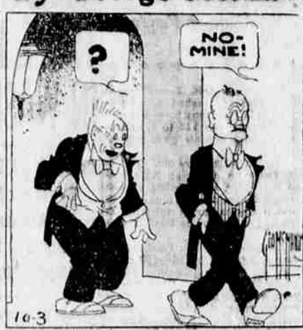
OH, I'M SORRY. I APOLOGIZE. MY MISTAKE.