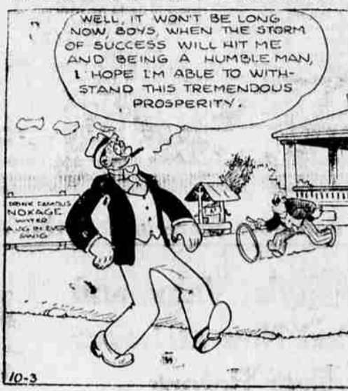
WELL, IT WON'T BE LONG NOW, BOYS, WHEN THE STORM OF SUCCESS WILL HIT ME AND BEING A HUMBLE MAN, I HOPE I'M ABLE TO WITHSTAND THIS TREMENDOUS PROSPERITY.