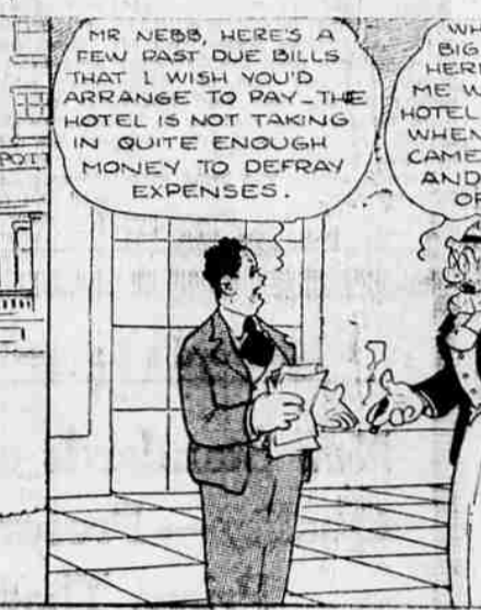
MR. NEBBS, HERE'S A FEW PAST DUE BILLS THAT I WISH YOU'D ARRANGE TO PAY. THE HOTEL IS NOT TAKING IN QUITE ENOUGH MONEY TO DEFRAY EXPENSES.