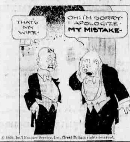
THAT'S MY WIFE.