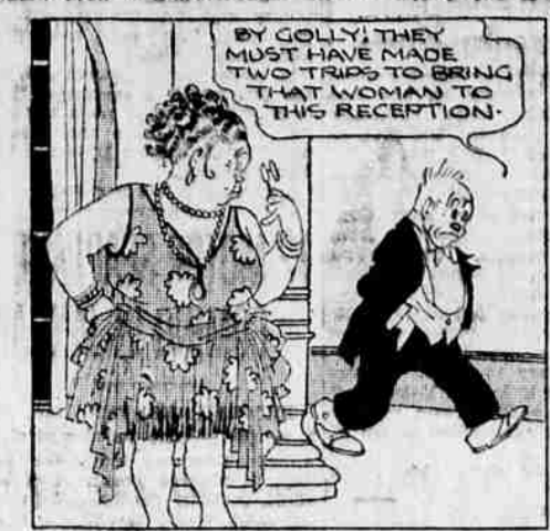
BY GOLLY! THEY MUST HAVE MADE TWO TRIPS TO BRING THAT WOMAN TO THIS RECEPTION.