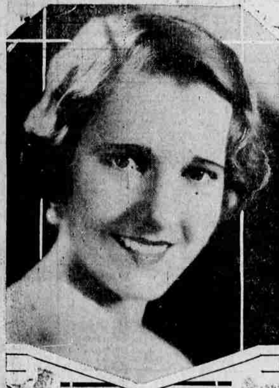
SHE'S THE FAVORITE OF MANY THEATERGOERS. Of course, it is needless to say the charming young lady above is Jean Arthur, one of the younger and most gifted cinema stars—especially if she's one of your favorites.