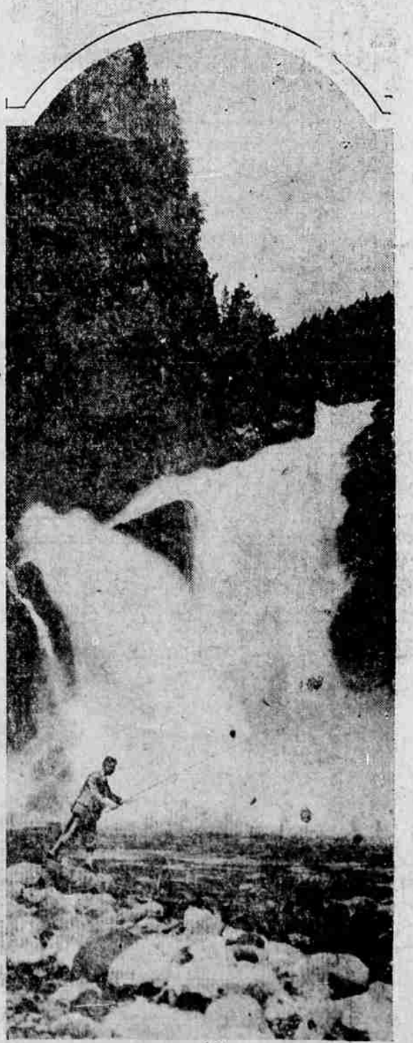
A FISHING HOLE OF BEAUTY, where big trout play in the turbulent waters, is this spot beneath Cameron Falls in the Canadian Rockies.