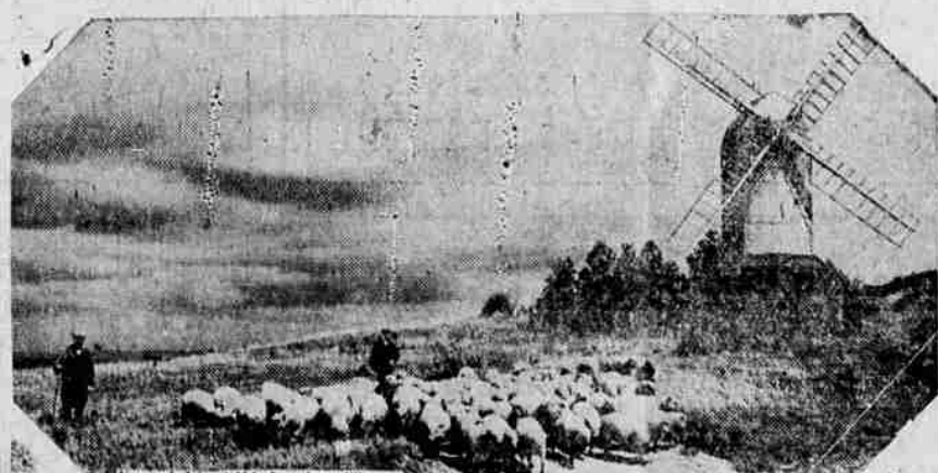
A FLOCK OF SHEEP, SOFT CLOUDS, AND A WINDMILL—and there's a scene that beauty lovers find entrancing. This charming photograph showing a windmill and a flock of Southdowns is a typical feature of the Sussex countryside in England.