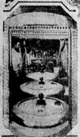
THIS INSIDE PEEK into the all-metal cabin of the ZMC-2, U. S. navy all-metal craft, shows the gas tanks and passenger seats. It was taken while the craft, which recently made a successful flight, was under construction at Detroit.