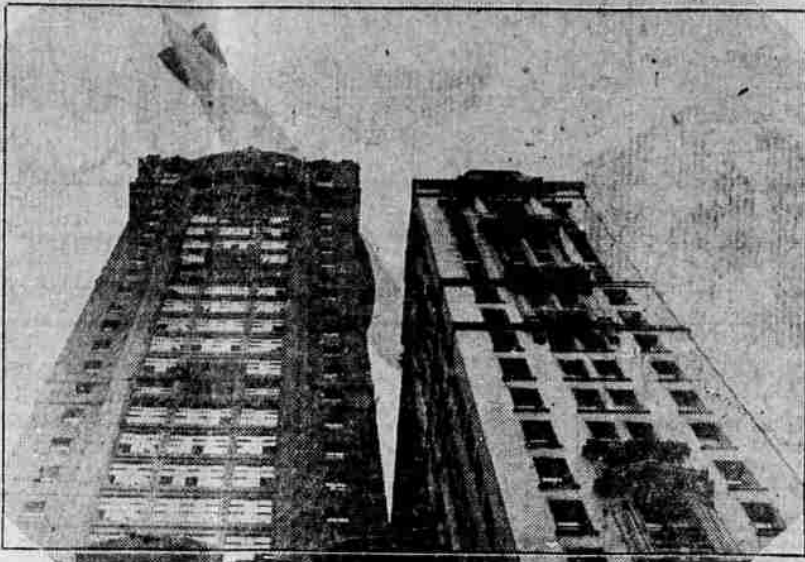
STRAIGHT UP AND DOWN the camera was tilted to snap this unusual view of the huge Los Angeles as it passed over New York. It is a spectacular glance of the lighter-than-air craft as it soared above the tall buildings.