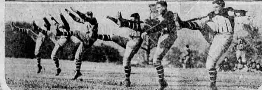
EVERY KICKING LEG UP HIGH, EVERY HEEL OFF THE GROUND—yeah, football season is here again! Members of the C. C. N. Y. squad are shown as they limbered up gracefully at an early kicking practice.