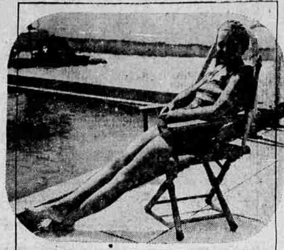
JUST ENJOYING LIFE! Norma Talmadge seems to find lolling around after a swim a great pleasure and she spends most of her time in and around the water when not busy at the studio.