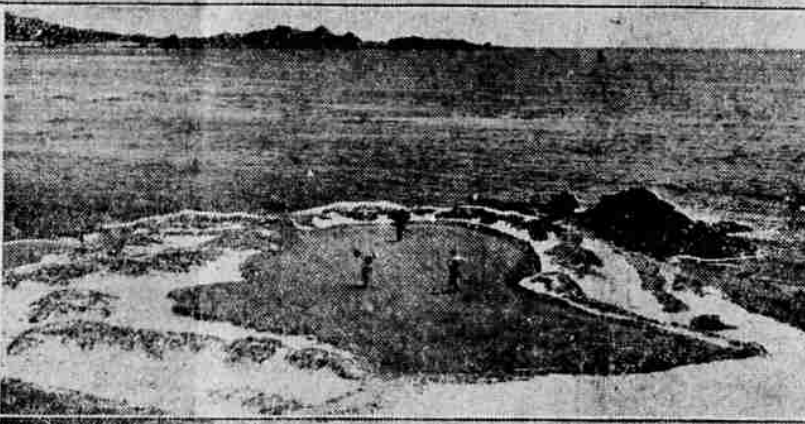
THE SINK-OR-SWIM SHORT SEVENTH HOLE WHERE BOBBY JONES lost his national amateur title during the recent championship tournament at Pebble Beach, Calif. A beautiful hole, with the green overlooking Monterey Bay, it is one that demands utmost accuracy—or else your ball goes into the water and is lost.