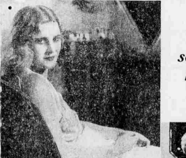
Jeannette Loff, charming Pathé star, says: "No matter what climate my pictures take me to, or how hard the water, I have found that Lux Toilet Soap keeps my skin enviably smooth."