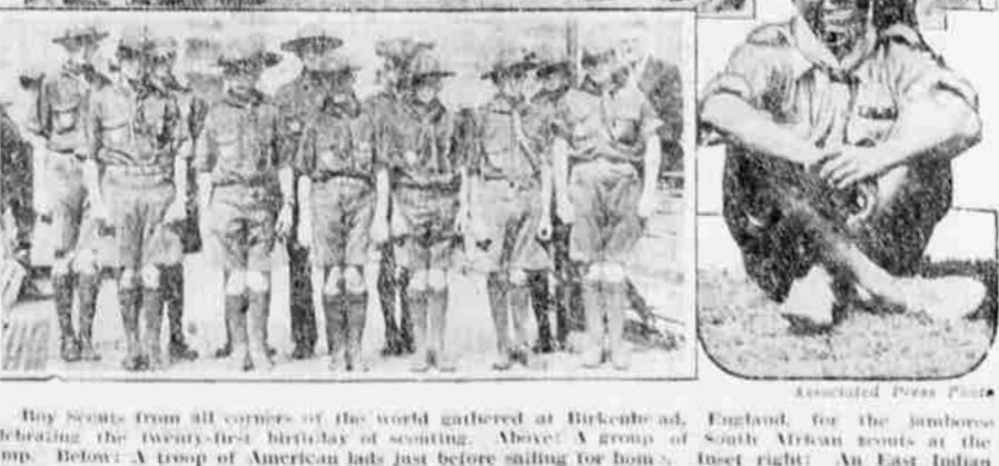
Boy Scouts from all corners of the world gathered at Birkbehead, England, for the jubilee celebrating the twenty-first birthday of scouting. Above: A group of South African scouts at the camp. Below: A troop of American lads just before sailing for home. Inset right: An East Indian scout.