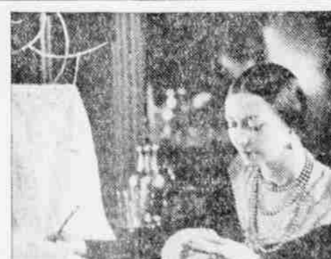
Department Buyers 92% of those interviewed in 132 leading stores—insist on Lux for their own things! (Above) A clever buyer selecting fine imported lingerie. Knowing how important the right cleansing is, these experts choose Lux!