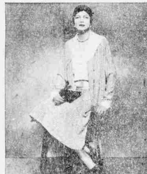
Fifth Avenue Dressmakers Insist upon Lux to keep stockings and lingerie worn by mannequins with the smart costumes they model, like new twice as long. (Above) A charming mannequin models a suit in gingham checks—an important Bergdorf-Goodman design for spring.