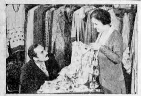
Million-Dollar Wardrobe Test Proves Lux Most Economical Above, wardrobe mistress and costume director discuss tests involving million-dollar movie wardrobes. "A box of Lux seems like a small thing," Metro-Goldwyn-Mayer officials say, "yet it stands for dollars upon dollars saved in the studio."... Lux saves clothes and money because, made of the purest materials known, it has no harmful alkali... and with Lux there is no rubbing to weaken or strain.