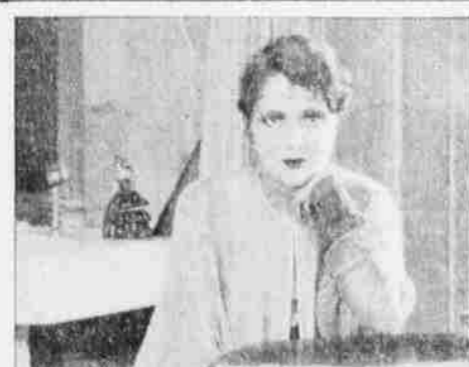
Great Movie Studios all use Lux to double the life of lovely clothes, such as this enchanting negligee of chiffon and satin, worn by Billie Dove, First National Star. Billie Dove, like other stars—and all the big movie studios—trusts fine things only to Lux!