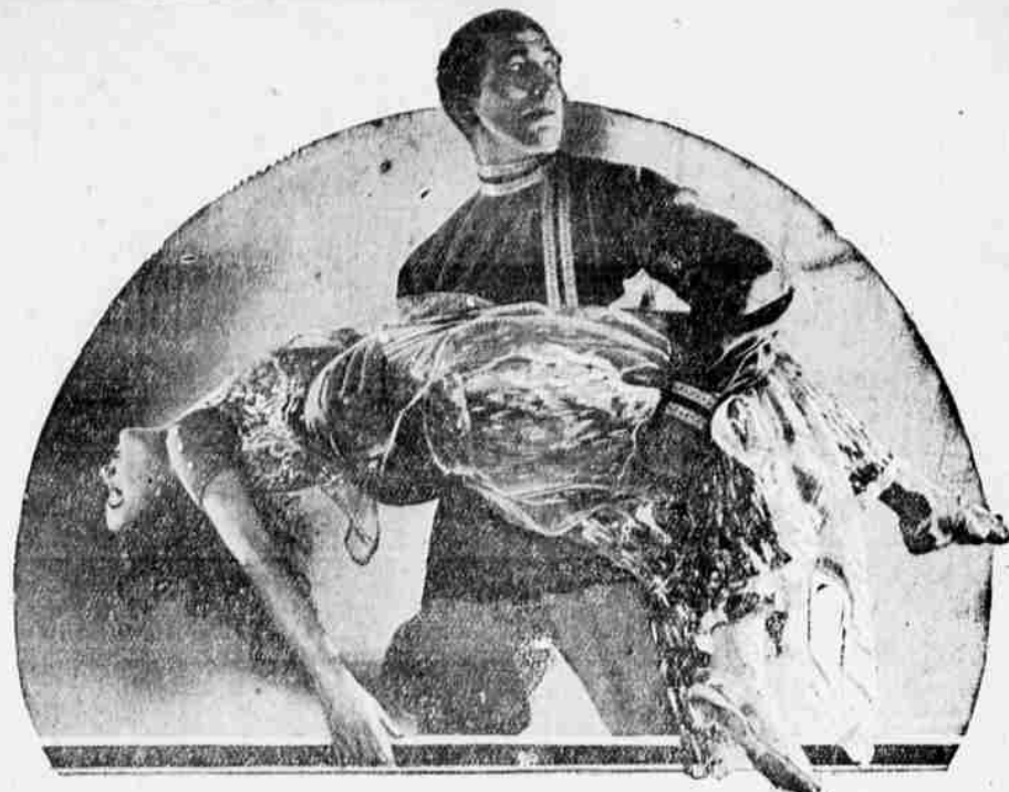
Myrna Loy and Victor McLaglen in "The Black Watch"

Romance, adventure, intrigue and love crowd every moment of "The Black Watch," a brilliant production with Victor McLaglen, which comes to Hunt's Craterian theatre tomorrow.